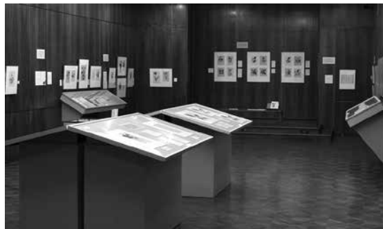
Two exhibitions a year are displayed in the gallery and often contain materials from our collections. The triennial International Exhibition of Botanical Art & Illustration focuses on contemporary art.

Cover, Fritillaria imperialis , Fritillaire impériale [ Fritillaria imperialis Linnaeus, Liliaceae], stipple engraving proof by de Gouy (fl.1802–1816), 52 × 35.5 cm, after an original by Pierre-Joseph Redouté (1759–1840) for his Les Liliacées (Paris, Didot, 1805, vol. 3, pl. 131), HI Art accession no. 4688.