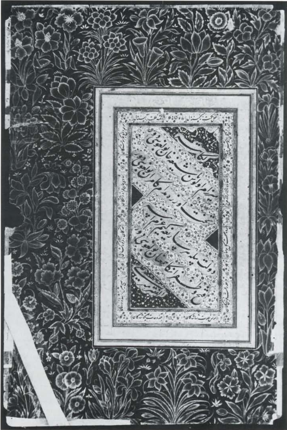
Figure 3. Specimen of calligraphy: Verses calligraphed by Mir 'Ali (on the reverse of Mansur's tulip).