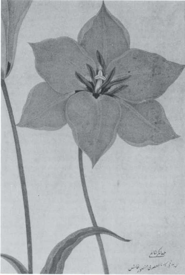
Figure 2. Details of the tulip.

in the painting, while the bud of Tulipa clusiana is described as “green”). The bright red blossom is well-balanced by the subdued pigment used in colouring the leaves. Mansur added rhythm to the composition by projecting the flowers in three different stages of development.